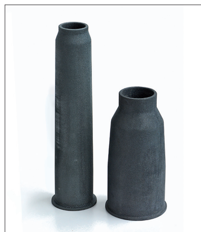
Fig. 3 SiC burner tubes

for one year without distortion or breakage. The post design was optimised so that the spacing of the teeth matched the customer's specific product line.