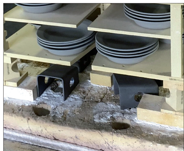
Fig. 1 SiSiC flame deflectors

Manufacturers need to maximise the fill in any furnace or kiln if they want to minim-